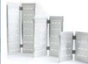
Single Fold Ramps